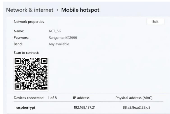
Fig. 5. Raspberry Pi connected to mobile hotspot with assigned IP address

(A Monthly, Peer Reviewed, Refereed, Scholarly Indexed, Open Access Journal)