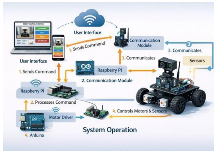
Fig. 1. System Architecture of Hybrid Raspberry pi-Arduino Robotic System

The system architecture of the proposed hybrid Raspberry Pi–Arduino robotic system is designed to achieve efficient real-time control by combining high-level processing and low-level hardware control. The architecture consists of multiple interconnected modules, including the user interface, processing unit, communication module, control unit, and robotic platform. This hybrid structure ensures optimal task distribution and enhances system performance and reliability.